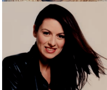
Chen Reiss, soprano