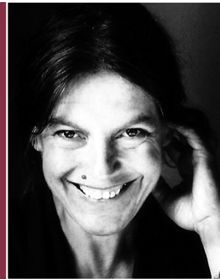
Angela Winkler Alma Mahler