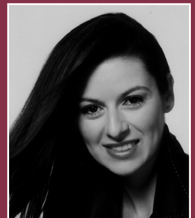
Chen Reiss soprano